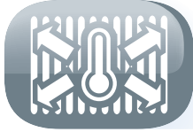
Circulated heat technology