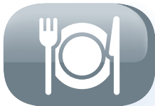
Number of people 5-6