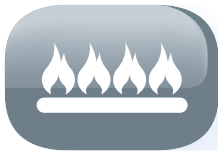
Stainless steel burners