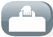
Easy to move