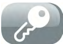
Child proof lock