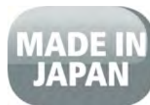
Made in Japan