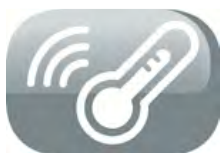
Room temperature thermistor