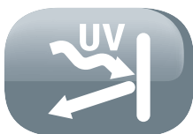
UV protected glassdoor