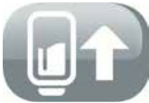
Removable fuel tank

Unique double combustion system: This heater is equipped with a double combustion burner. The first fuel combustion occurs in the primary chamber. The secondary chamber burns the exhaust gases at an even higher temperature. This results in a clean combustion without condensation at an efficiency of nearly 100%.