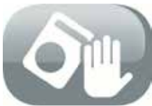
Automatic tip-over switch

High efficiency: This heater has a 99.99% heat efficiency with infrared radiation heating.