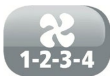
4 fan speed settings