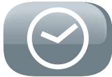
24 hour timer