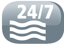
Permanent water drainage tube