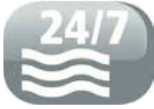
Permanent water drainage tube