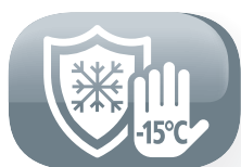
Extra frost protection in outdoor unit