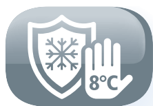
Home freezing prevention