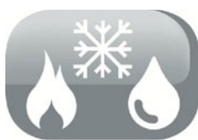
3 functions in 1