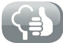
Environmental friendly (carbon neutral)