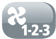
3 Fan speed settings