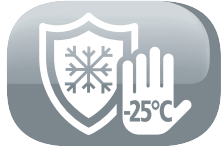
Extra frost protection in outdoor unit