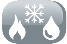
3 functions in 1