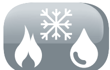
3 functions in 1