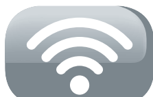
Wireless smart kit