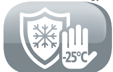
Extra frost protection in outdoor unit