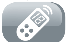
Remote control with LCD display